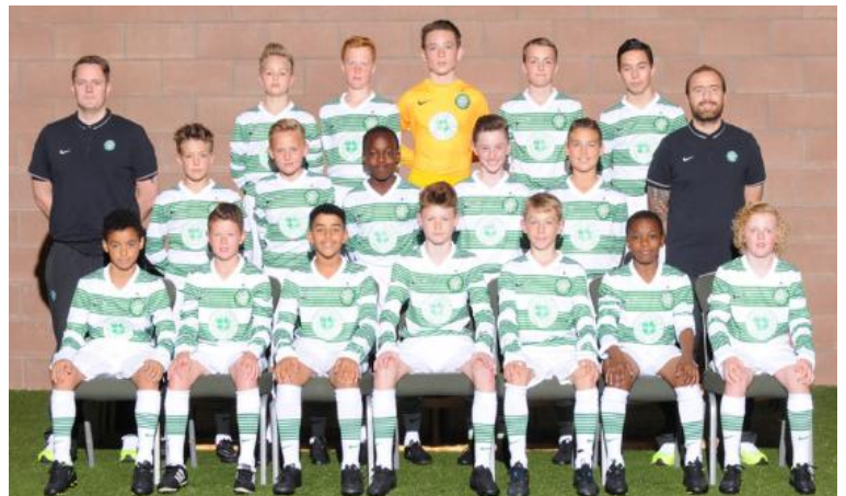
Under 13's squad: Season 2014/2015